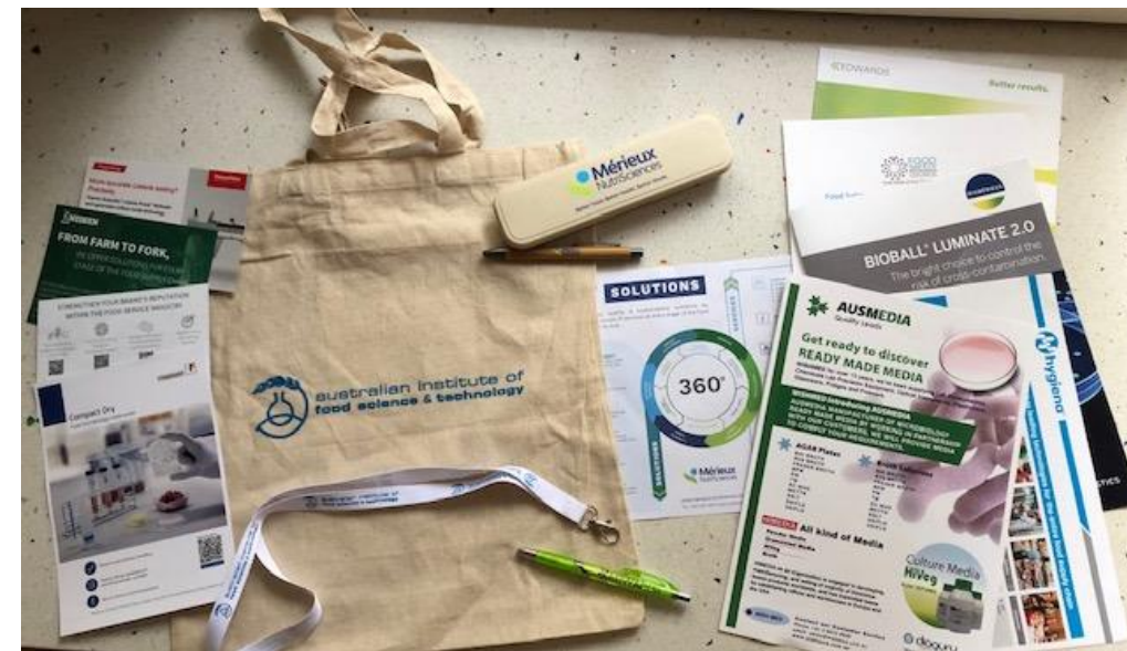
Delegate Tote Bags (insert)