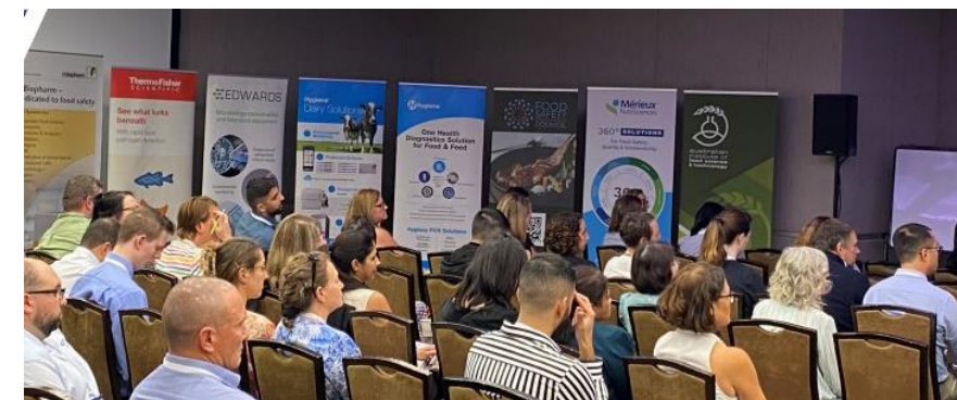
Pull Up Banner Display